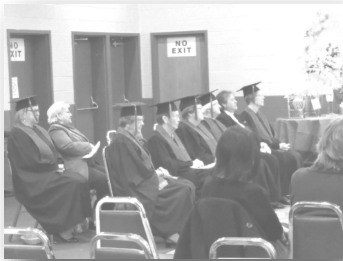
Winchester & Visiting Collegians Honor the Day!