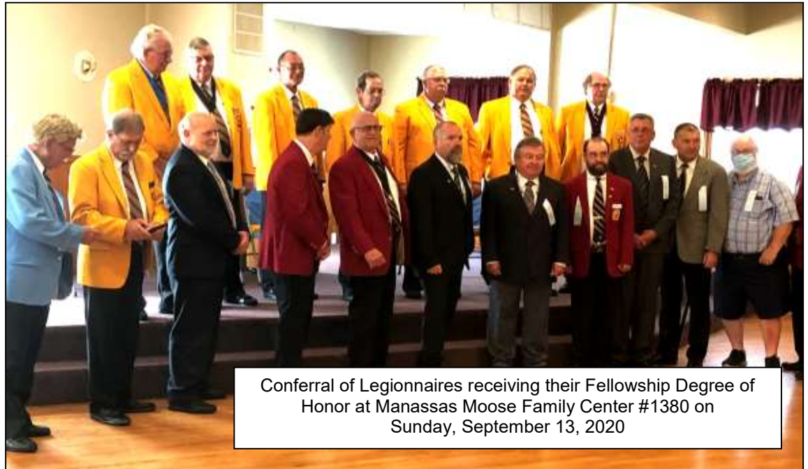
Conferral of Legionnaires receiving their Fellowship Degree of Honor at Manassas Moose Family Center #1380 on Sunday, September 13, 2020