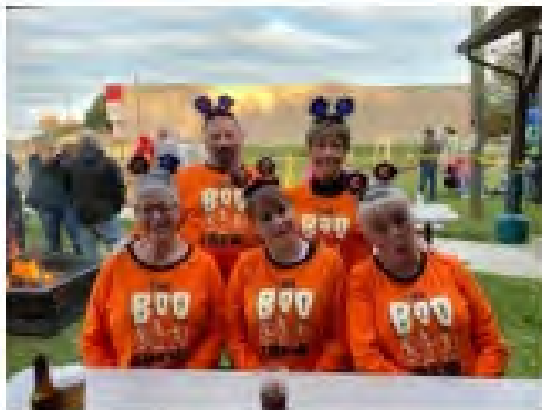
The Bar Crew...