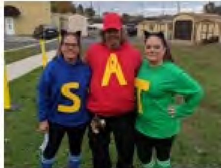
Halloween Dance - the Chipmunks