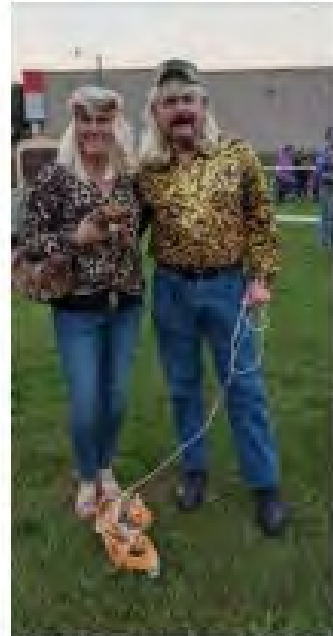
Halloween Dance - something to do with Sigas.