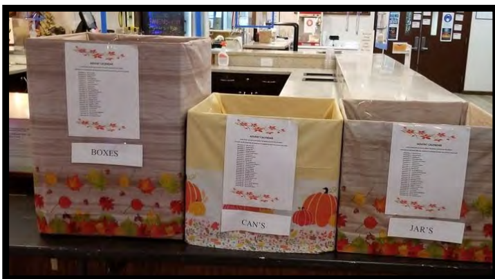
Food Drive Boxes