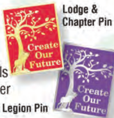
Lodge & Chapter Pin